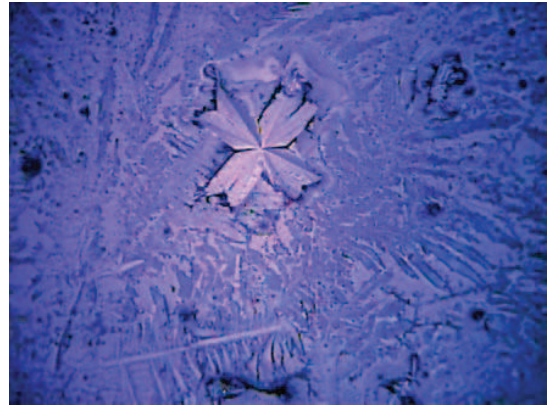
Sample: Neutrally, increases 400 subject

Both in more technical and in biological regard an immense quality projection/lead resulted here opposite the neutral sample. Altogether the essence advanced by this positive effectiveness into the leading group of the certification-scale and also this test row. Relevant were here above all the changes of the structures in the water, which were completely again arranged and a strong approximation to a high-quality spring water quality to have experienced, during itself the chemical parameters, up to the redox potential, not substantially opposite the neutral sample have changed. The extremely strong positive change of the entire structure of the water, which brings out dominant only star configurations, reaches an overall quality of a high-quality spring water.